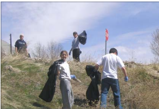
During National Youth Service Day, the youth of Butte came out in force to clean up trash on the streets and hillsides of Uptown.

During the third quarter, 570 volunteers were engaged by Campus Corps members to serve 5,307 hours on 11 service projects . The projects included: