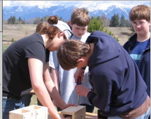
Kalispell Junior High School students help to build collection bins for aluminum cans during Habitat University at Flathead Valley Community College in April 2006.