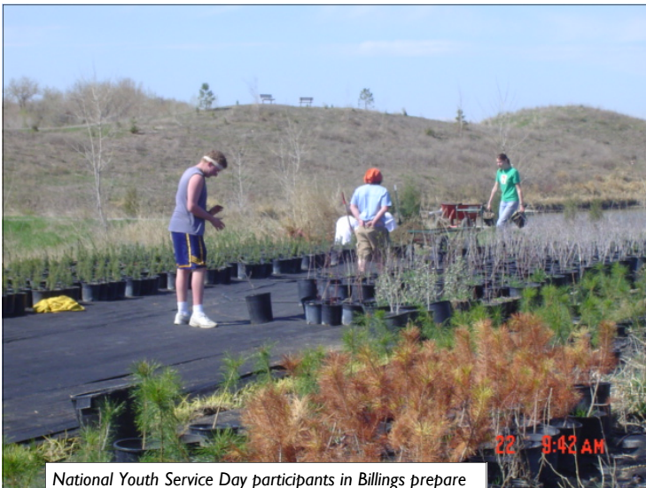
National Youth Service Day participants in Billings prepare to do some planting at the Conservation Education Center.