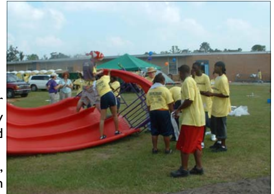
Slide being assembled by a team of volunteer builders.