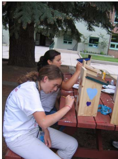
Upward Bound participants build birdhouses to beautify Butte walking trails.

During the entire 2005/2006 program year, 65 Campus Corps members placed 3,120 non-AmeriCorps volunteers on 47 community-benefiting service projects across the state which benefited 6,832 people . These generous volunteers donated 19,421 hours of service to the state, and 88% of volunteers surveyed indicated that the service project they worked on was a worthwhile opportunity to address community needs and 80% expressed a desire to serve again. One of the greatest strengths of Campus Corps is recruiting volunteers for projects that make a difference in the community!