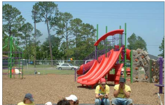
Slide in upright position at the newly created Kaboom! playground.