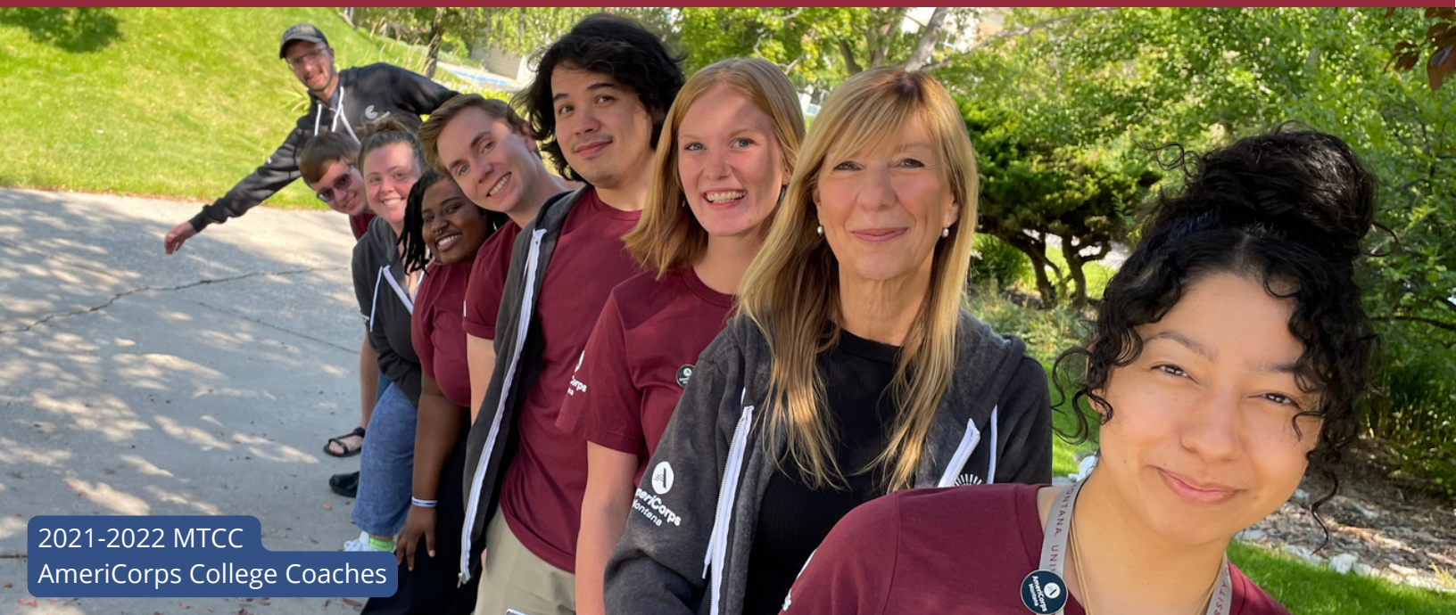
2021-2022 MTCC AmeriCorps College Coaches